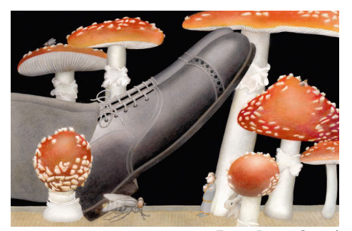
Eugène Ionesco Conte 4